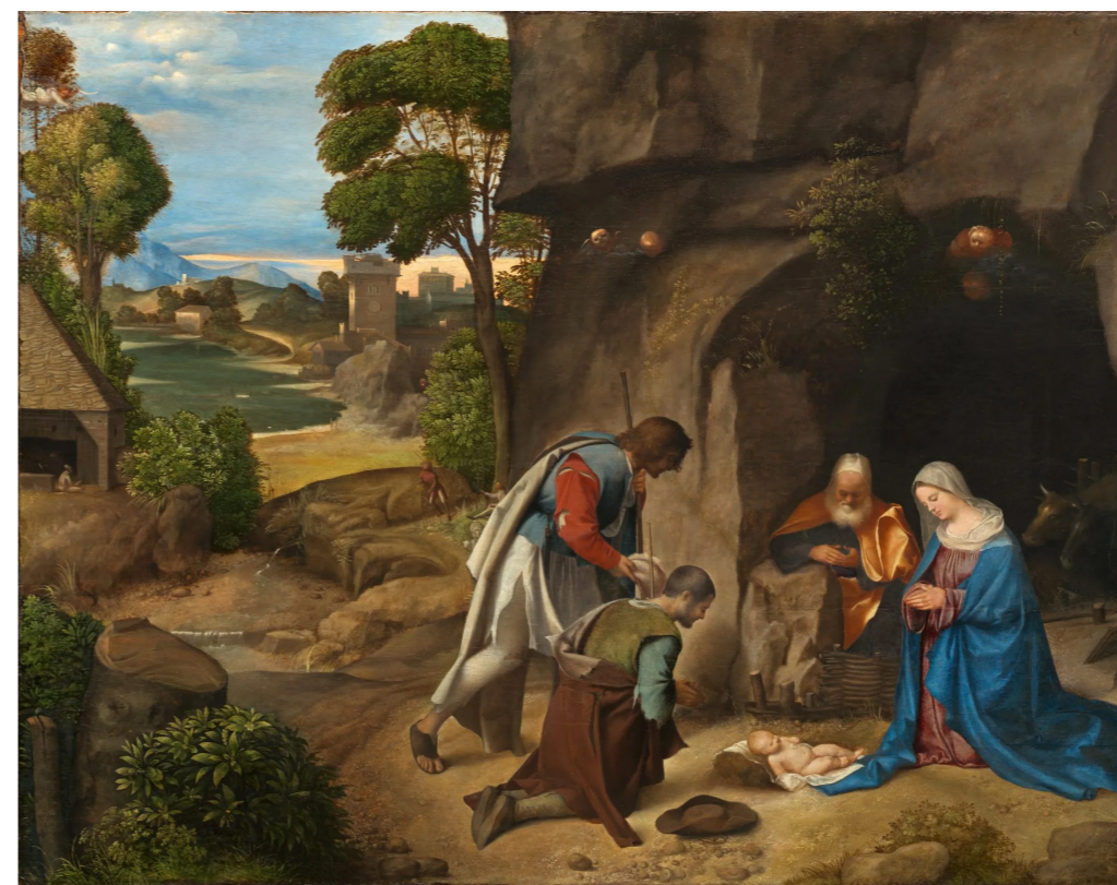
The Adoration of the Shepherds, Painted by Giorgione (1477-1510), National Gallery of Art, Washington DC